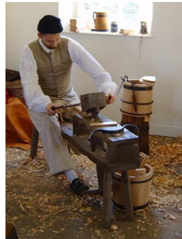
Cooper apprentice at CWF