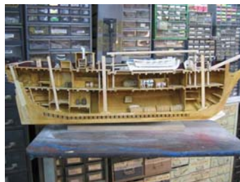
Longitudinal Interior view of the Columbia

The exhibit was brokered through prestigious American Marine Model Gallery, located in historic Salem, Massachusetts, one of America's busiest seaports and maritime centers during the Great Age of Sailing.