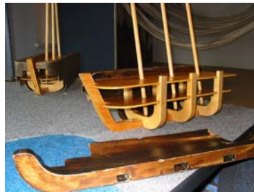
Ship puzzles at USS Constitution

Cooperage, puzzles and a six foot figurehead offer novel sites to visitors. Assemble a ship, build a bucket or gaze upon the Lady Columbia . What better way to attract the younger generation than to engage in a maritime activity. Friends from the USS Constitution gave the Garibaldi Museum blue prints for a ships puzzle. Bill Drinon, Salisbury, MA, constructed the puzzles.